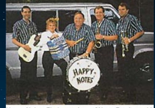
Happy Notes.